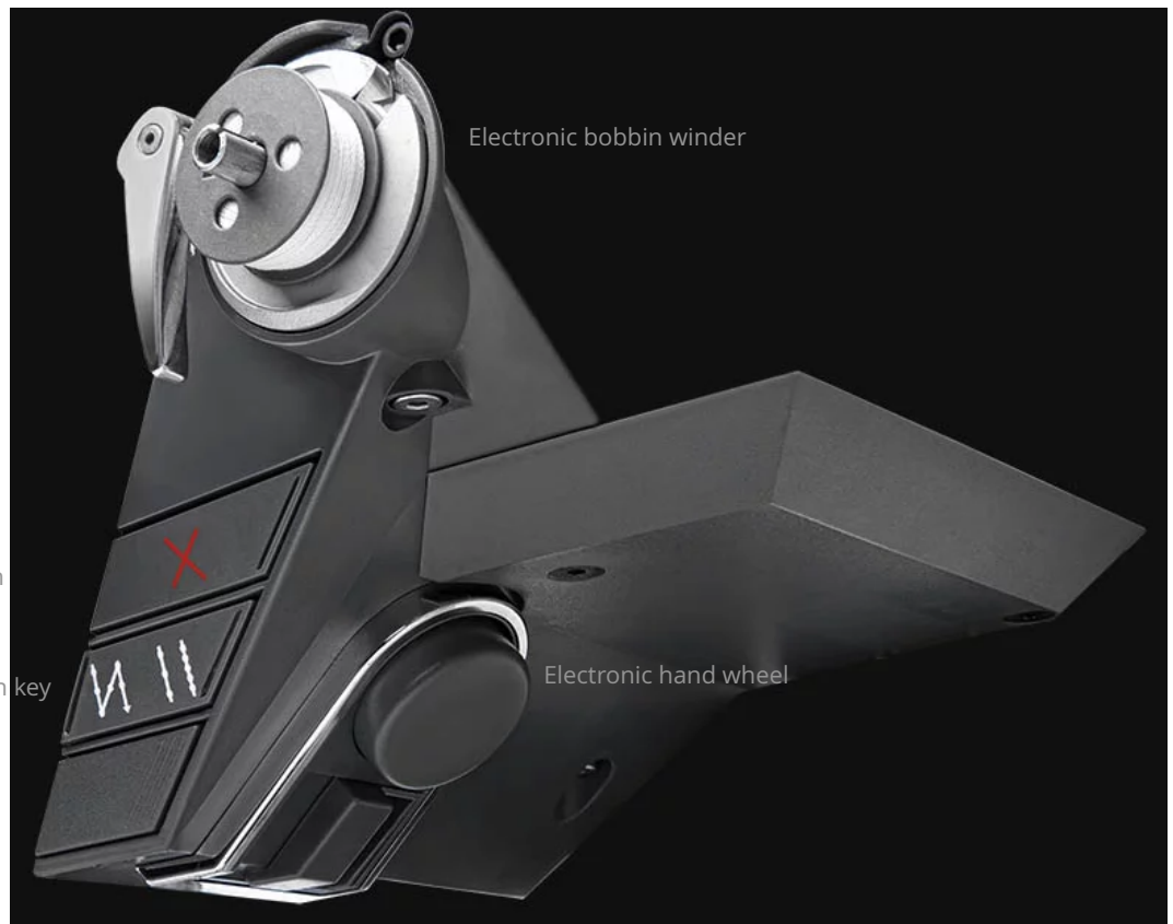
Electronic bobbin winder

Every operating element in the direct handle area